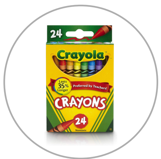
1 box of wax crayons

Please do not label the following items as supplies will be shared communally amongst all students