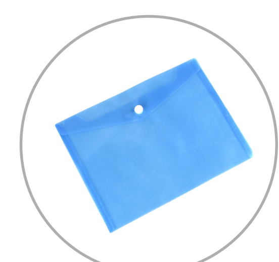
1 large plastic file folder (to hold agenda & other papers)