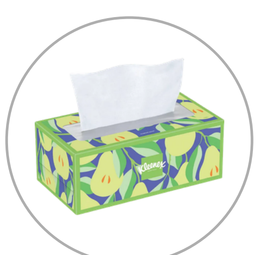
2 boxes of Kleenex/tissues