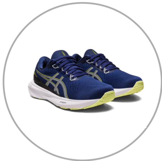
1 pair of Velcro running shoes for daily use - NO LACES PLEASE

School supplies are the items that students need in school to help them learn. PLEASE LABEL the following items: