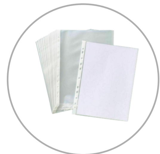
50 pack of plastic sheet protectors

Please do not label the following items as supplies will be shared communally amongst all students