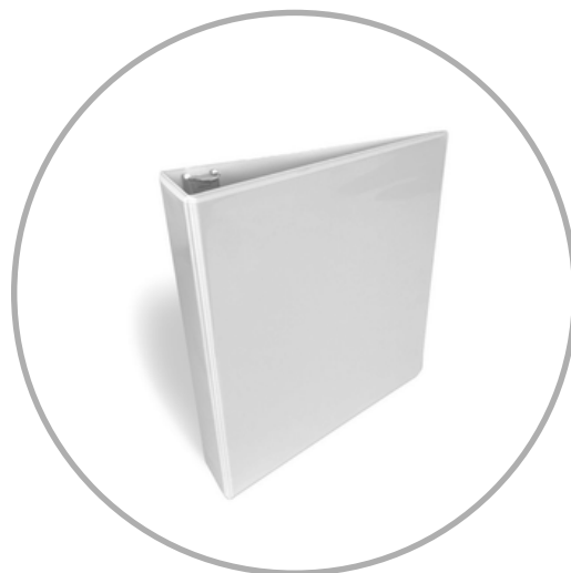
1 white 2" Binder for their portfolio