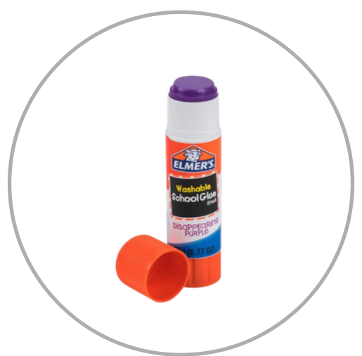
3 large glue sticks (preferably purple)