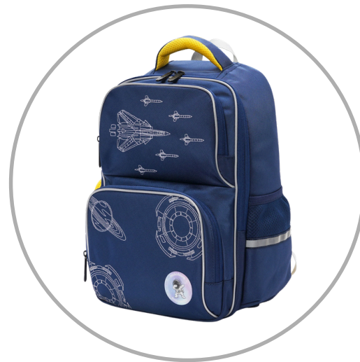
1 backpack - Please make sure it is LARGE