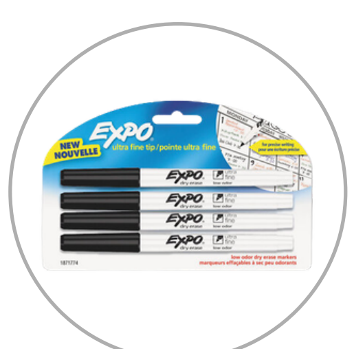
4 dry erase markers (preferably black & fine tip)