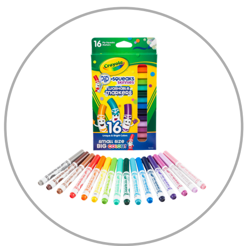
1 box of markers (preferably thin/fine, like Crayola's Pip Squeak Skinnies)