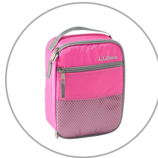
1 lunch bag or lunch box - It should be able to fit inside their backpack easily