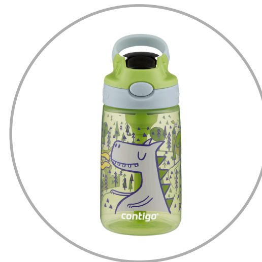
1 water bottle