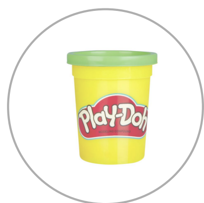
2 Containers of Playdough These will be used for fine motor activities.