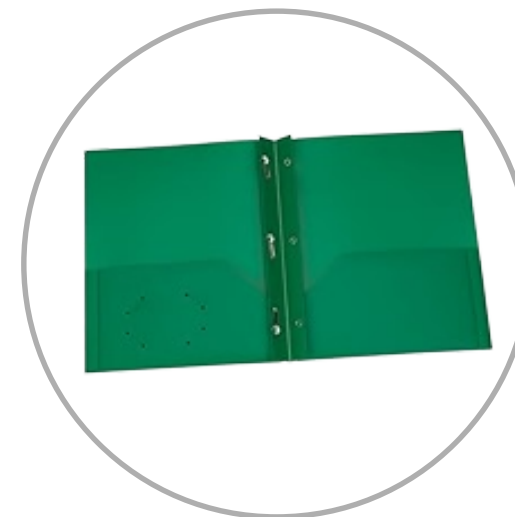
1 plastic duotang (this will be your child's agenda - colour does not matter)