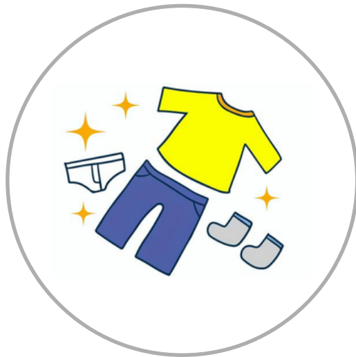
1 change of clothes in a Ziplock bag