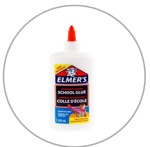
1 bottle of white liquid glue